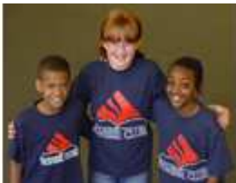
Navy w/Pioneer Clubs Logo

If at this time, the fees and handbook charges are not financially affordable to you, would you please let us know by placing a check mark in the box. Please complete this form for our records and we will provide a Handbook and a Bible, if needed, and waive any fees.